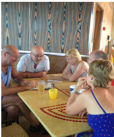
"You'll know this one, lads. 4 letters, starting with W, ending in K; what sailors do at sea." (Answer: Work)