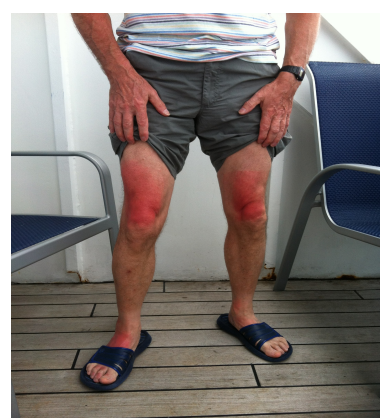
Me. Day 8. Brit abroad!