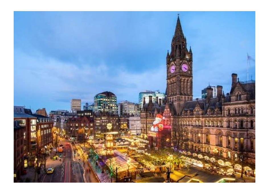
S61 Mini Reunion 11 - 13 September 2020 - Manctopia - The Covid Reunion