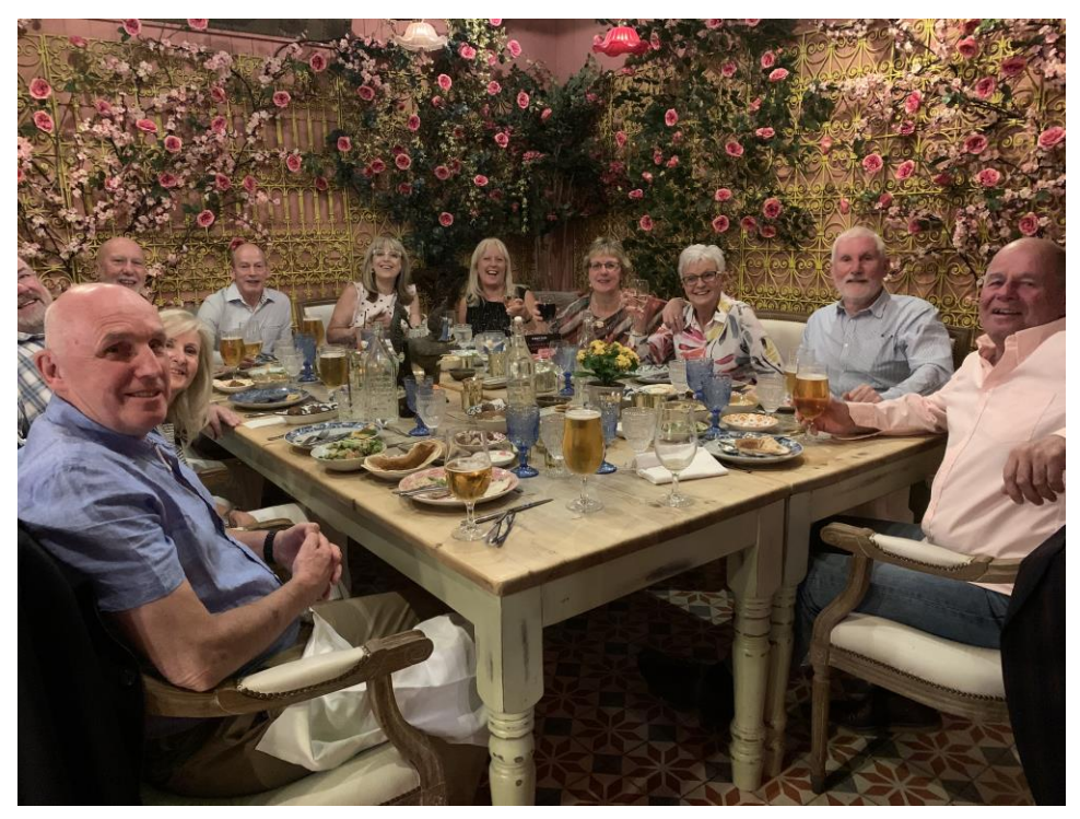
I beg your pardon; you never promised us a Rose Garden!