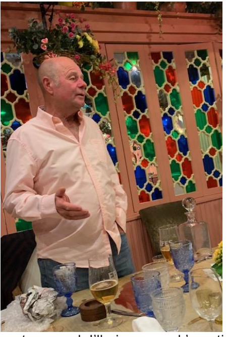
"If I have to cancel, I'll give a week's notice – Fair enough?"

Just as we had done the previous evening, we managed to enjoy ourselves enormously, whilst conducting ourselves with sufficient decorum to be given a lengthy extension by an appreciative staff. Or maybe we are just good tippers!